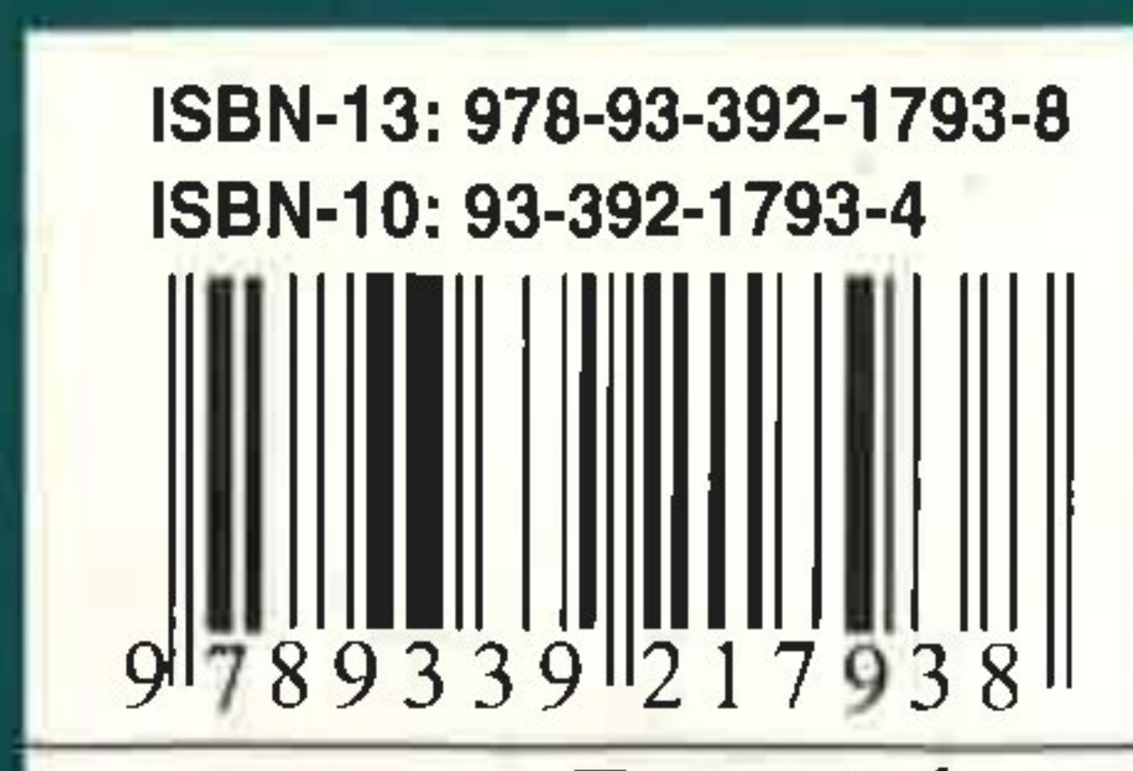
Price : ₹ 1050/-